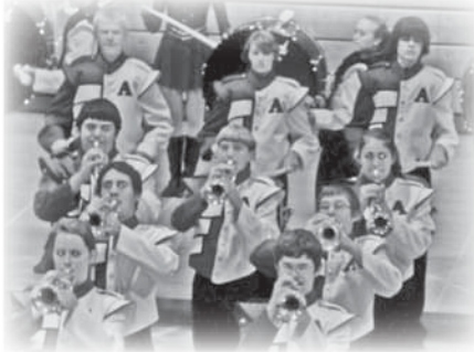
TRUMPETS performed as part of the fall Marching Band Show in the AHS Junior Varsity gym.