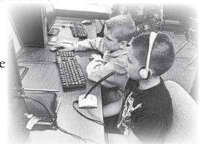
L810 STUDIO CLUB MEMBERS in the new studio at Leighton School.

A before school club ( STUDIO CLUB ) at Leighton School has set up a new L810 STUDIO where they are learning how to write scripts in groups using Google Docs, set up shots in Wirecast software, and use teleprompters and a soundboard. The Studio Club will be doing the Leighton School's announcements that will be streamed live from the studio to the classrooms via SMART Boards.