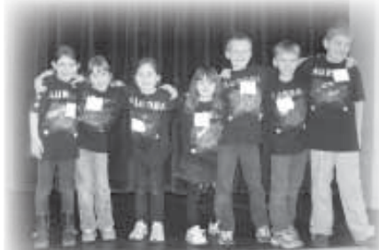
Destination Imagination team.

This is a photo of the Craddock School DESTINATION IMAGINATION second grade team that was given the " Spirit of Discovery and Imagination " Award.