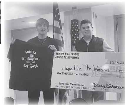
AHS Junior Achievement Presented Check for $1,200 to Hope for the Warriors

The Aurora High School Service Learning Class held their annual Veterans Dinner celebration in appreciation of their service. On December 7, 2022, veterans and a guest were treated to a complimentary dinner with music provided by the members of the AHS orchestra. The evening was then capped off by a wonderful holiday choir concert performance in the AHS auditorium. AHS Junior Achievement students also presented a check for $1,200 to Hope for the Warriors non-profit organization that provides assistance to combat wounded service members, their families and families of those killed in action. THANK YOU to all our area veterans who have served our country.