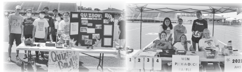
Quiz Bowl Volleyball