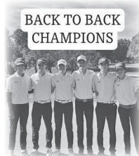
BACK TO BACK CHAMPIONS